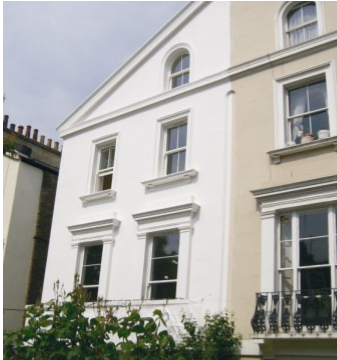
Just like new