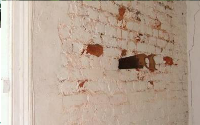
Surreal and idiosyncratic decor