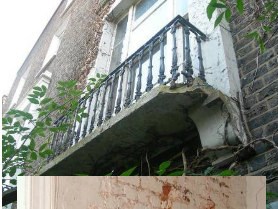
Thermal Bridges galore