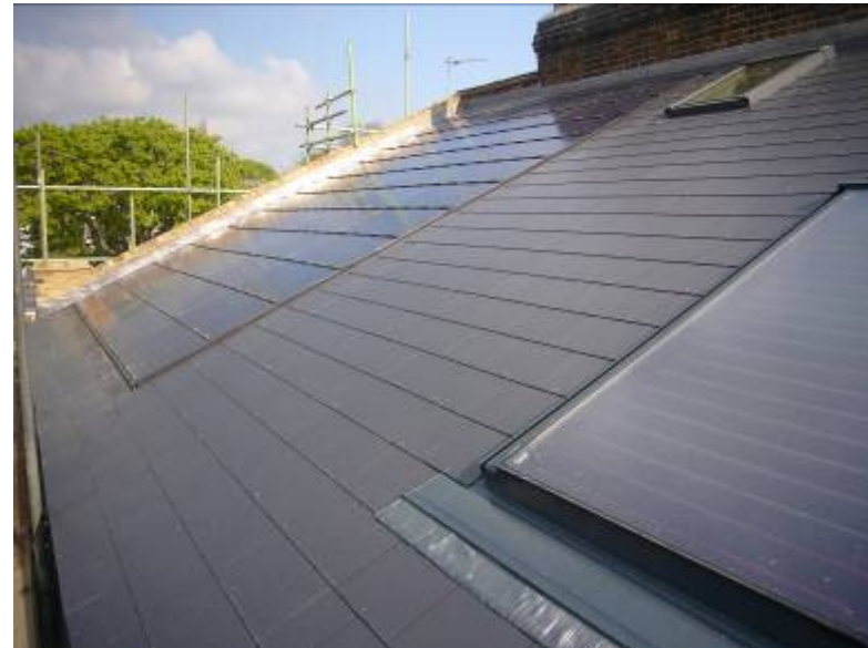
With renewable additions