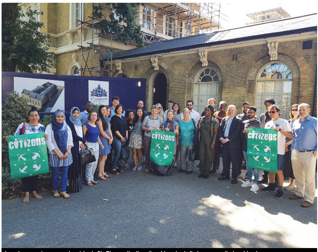
Local campaigners and residents St. Clement's, the site of London's first community land trust