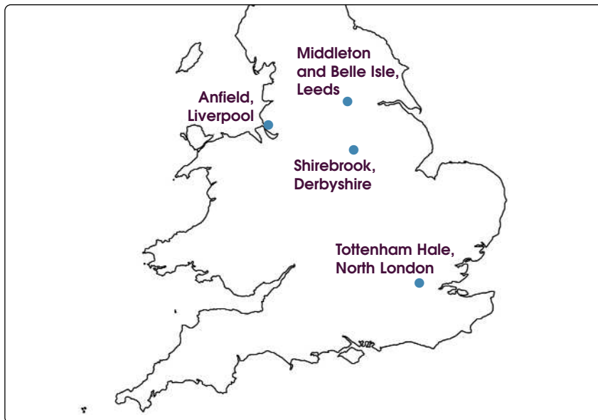
The four case study locations

inter-relationship between the factors that lead to social exclusion (for example, the links between poverty, social mobility, health, and education) has become more sophisticated. However, there is less clarity about what our policy responses should be and about the geographical level at which they should be implemented.