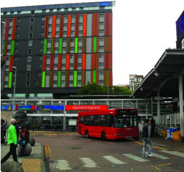
Tottenham Hale station

Masterplan , 62 was adopted in October 2006 to guide the redevelopment of Tottenham Hale, along with the more recent A Plan for Tottenham , 63 noted above. The latter is not a planning document but sets out Haringey Council's and the Greater London Authority's aspirations for the area. An Area Action Plan for Tottenham Hale is currently being produced to direct the area's regeneration and achieve district centre status.