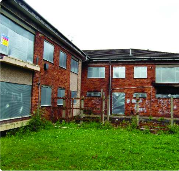
Housing in Shirebrook boarded up prior to demolition