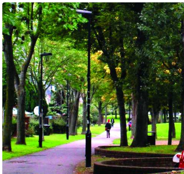
Green space at Ferry Lane Estate

In the ward neighbouring Tottenham Hale the research team were able to visit an ambitious and important community-led project aiming to support young people through a new community hub. 'Project 2020', supported by Homes for Haringey, has been established in Northumberland Park, where there are over 1,700 young people, 24% of whom are not in employment or full-time