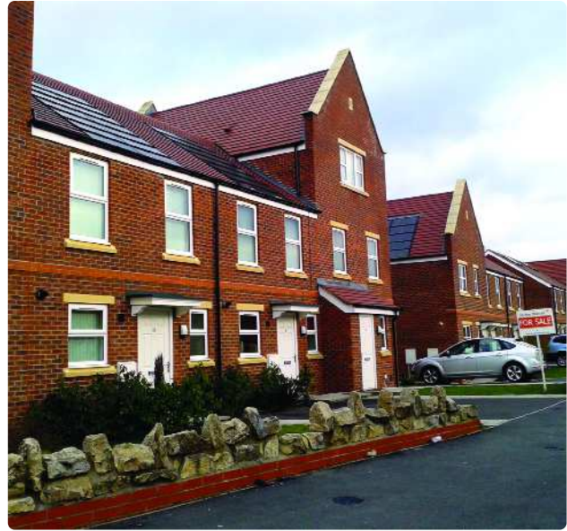
Newly built housing in Shirebrook

Nevertheless, many residents still strongly identify with the town, and some are defensive about how ‘outsiders’ seem to regard the town as ‘a problem’. Respondents noted that many men were proud of the physical nature of mining and were reluctant to take what they saw as menial, low-paid alternatives.