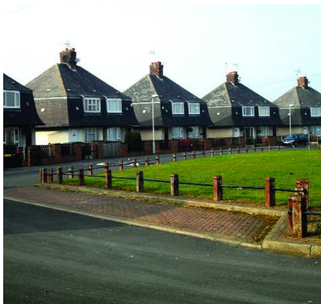
Garden City style housing in Middleton