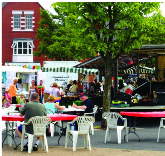
Shirebrook's market square

sector-based work academy was recently delivered in partnership with local employers, the Department for Work and Pensions, recruitment agencies, Chesterfield College, and Bolsover District Council. There is now a new commercial bus route, negotiated by Bolsover Partnership, the District Council and the Department for Work and Pensions, which has opened up opportunities for local people who otherwise would have struggled to access employment offered as shift work. Such measures may have had an even more beneficial outcome if they had been embedded in the beginning of the development process through pre-application dialogue. Establishing a strong community sense that the new opportunities were focused on local needs could have played a significant role in promoting social cohesion.