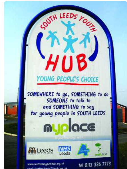
South Leeds Youth Hub, Belle Isle

consider the need to secure strong community accessibility.