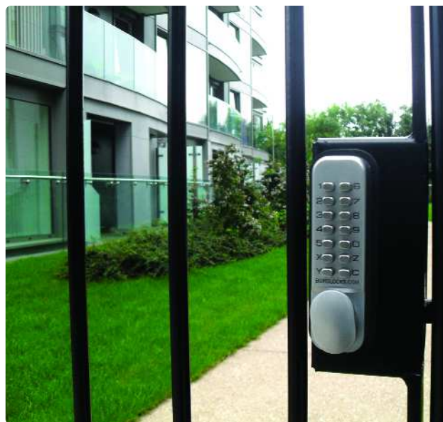
Hale Village private housing

While, as noted above, Haringey Council's Local Plan: Strategic Policies 2013-2026 69 makes clear that the Council aspires to integrate new and