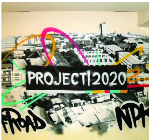
Project 2020 – about developing potential

don't travel very far from their area and if they do they travel by bus.'