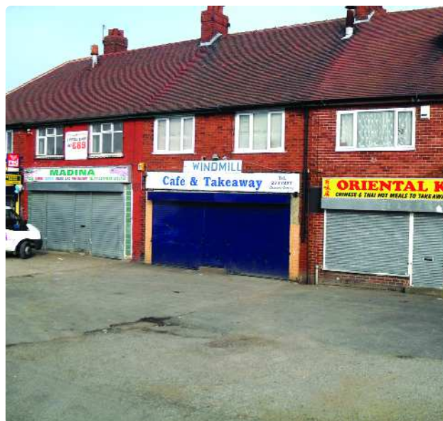
Shopping parade in Middleton

of the housing in the two areas is socially rented, which is high in comparison with the Leeds average. Over a third of residents of Middleton and Belle Isle have no qualifications, and there is a substantial – 38% – child poverty rate. Life expectancy is also lower than the Leeds average, and Incapacity Benefit claimant levels are high. Around 92% of Middleton and Belle Isle's population are white British and the British National Party (BNP) has received support in the area. 46