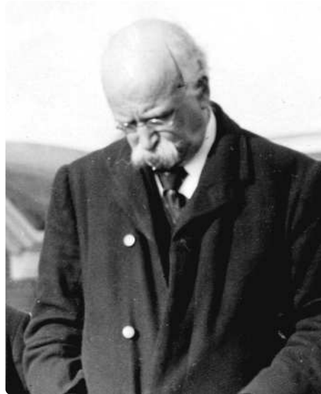
Beatrice Webb and Ebenezer Howard