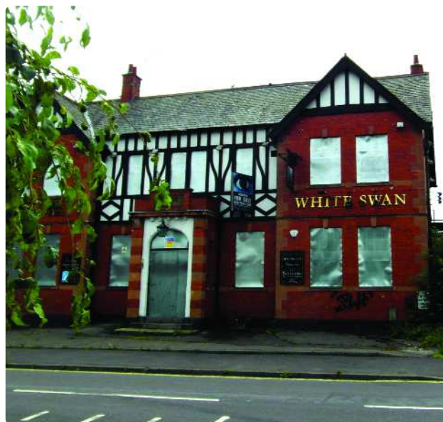
Shirebrook's White Swan pub – closed and boarded up

The third example of the challenge posed by the reliance on private sector regeneration is provided by experience of the development of the town centre. The centre of Shirebrook has a large market square which offers a large and well attended outdoor market. However, the area is in need of regeneration, and while some investment took place ten years ago there is an ambition for large-scale renewal which could see the wider redevelopment of the town centre. Planning permission was first granted in 2010 for a new Tesco store in the town centre with associated public realm improvements, following a number of years of negotiations with the retailer to develop the site. This involved the clearance of an existing pub and some 1970s social housing. Regeneration officers committed resources to drawing up a masterplan, including public consultation on a development brief to help resolve tensions between the needs of