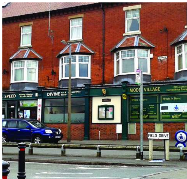
Part of Shirebrook Model Village

By mid-2013 unemployment had fallen to 3.2%, against a Bolsover average of 3% and a Derbyshire average of 2.5%. 38 Shirebrook's resident population is predominantly white British working class, 41% of whom do not have any qualifications. However, educational attainment is now improving. The proportions of pupils achieving level 4 at key stage 2 and level 5 at key stage 3 have increased steadily from 2001, and there has been an improvement in attainment at key stage 4 since 2001. The number of pupils going into further education and the numbers of 16-to-18 year olds in learning have seen increases since 2002.