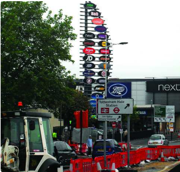
Traffic works on the approach to Tottenham Hale retail park

In 2007, the Government awarded Haringey £195.5 million of Decent Homes funding, and when work started on the programme in 2008 non-decency of council homes stood at 41.8%. When the programme finishes in March 2015, non-decency levels are expected to stand at 26.6%.