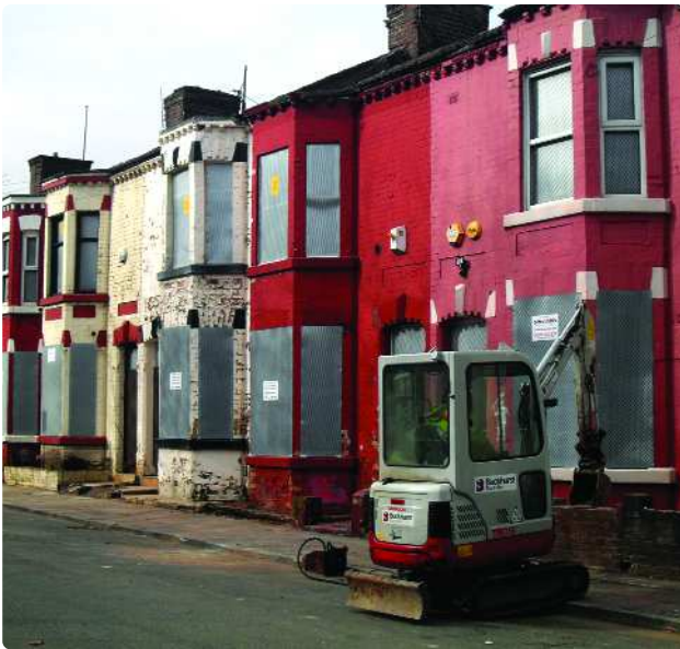
Abandoned and refurbished streets in Anfield