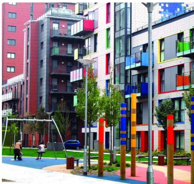
Hale Village social housing

neighbourhood in one of London's key Opportunity Areas, is a testament to the partnership approach of all the groups that have made it possible.' 67