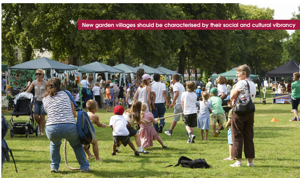
New garden villages should be characterised by their social and cultural vibrancy