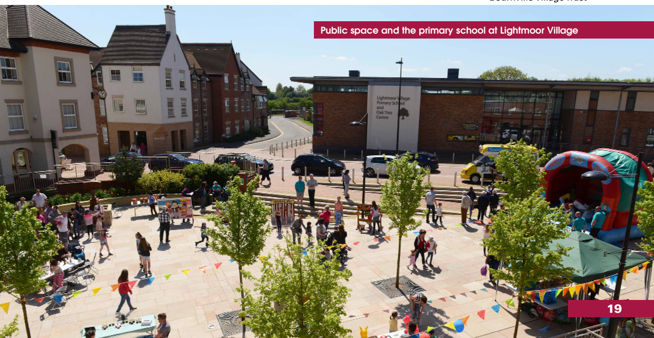
Public space and the primary school at Lightmoor Village