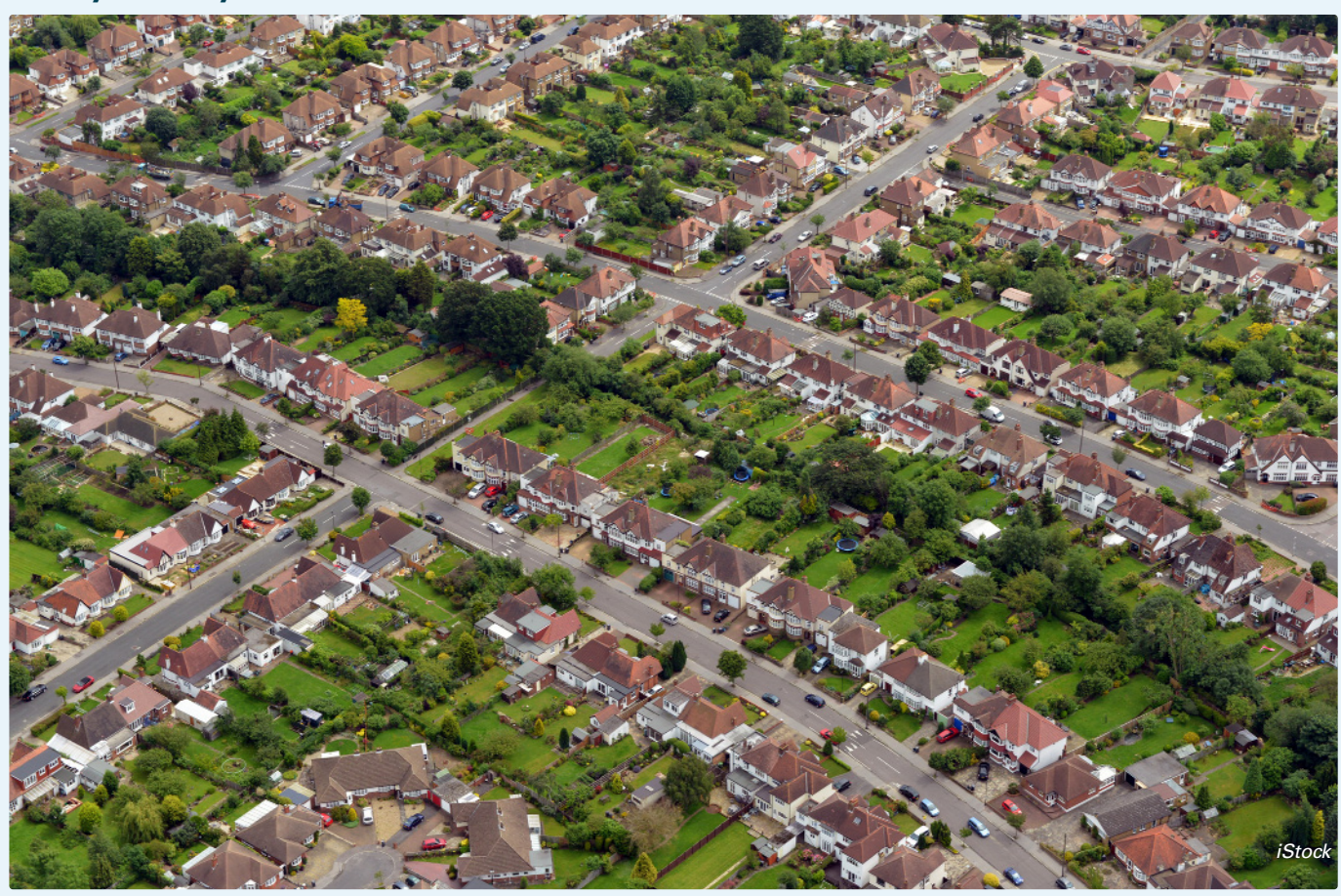
Housing in Surrey