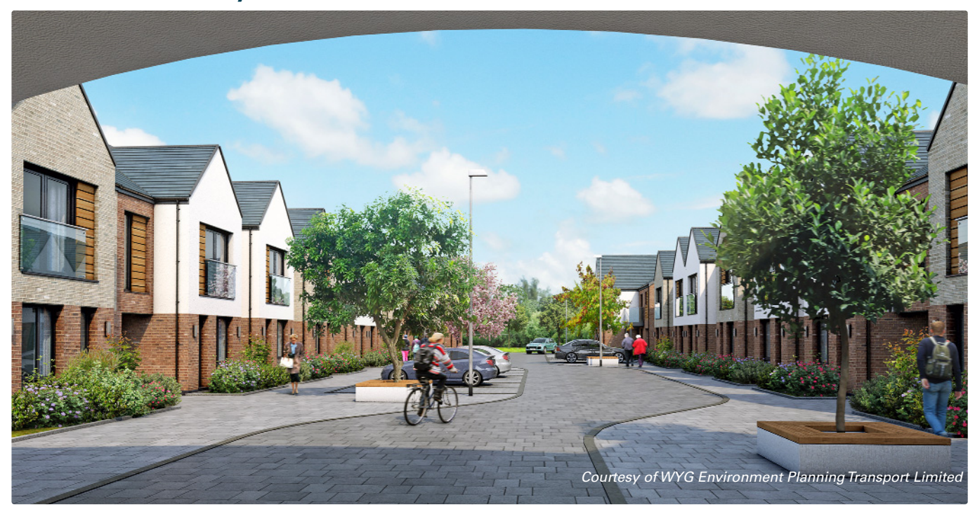
Proposed housing development at Baldock