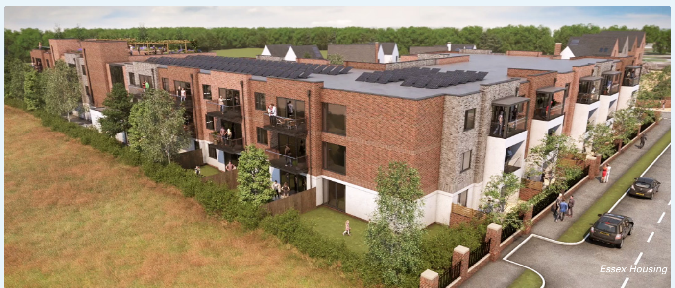
CGI of the Rocheway housing development