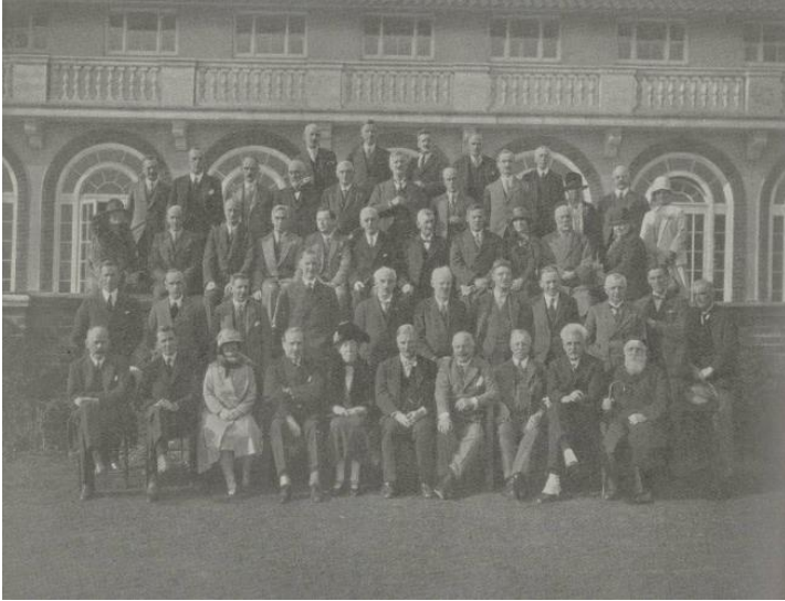
Members of the Garden Cities and Town Planning Association in Bournville in 1928