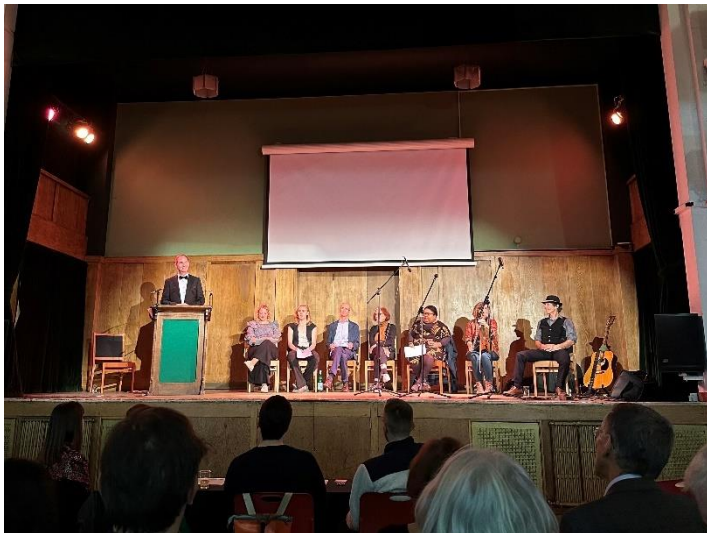
TCPA performance of 'Land of Promise' in 2022